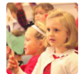
Family School/Saltbox School